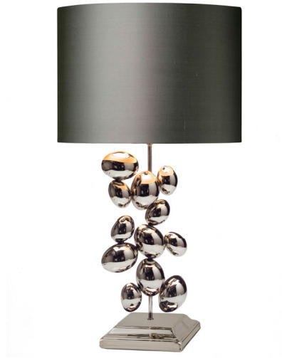
Table lamp made of steel with gloss nickel finish made with repulsed plate, with a surface treatment based on manual polishing and re-polishing so that the metal shines at its best, simulating river stones; joined together by welding.